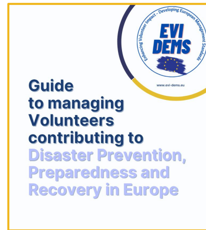
PR6: Guide to managing volunteers contributing to disaster prevention, preparedness and recovery in Europe