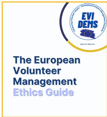
PR3: The European Volunteer Management Ethics Guide